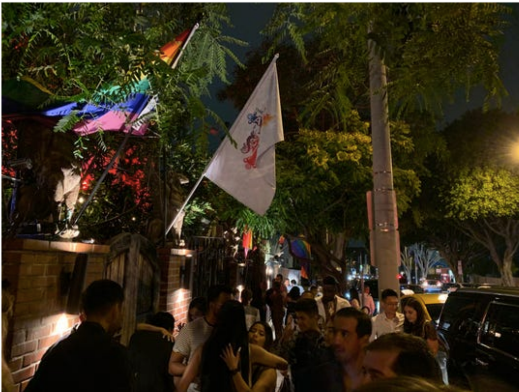
Patrons congregate on the sidewalk outside of The Abbey, a celebrated gay bar in West Hollywood, California, after the bar closed early on the morning of Saturday, June 15, 2019.

Nationally, bar closing times are far from uniform but instead are a patchwork that varies state by state and often even city by city.