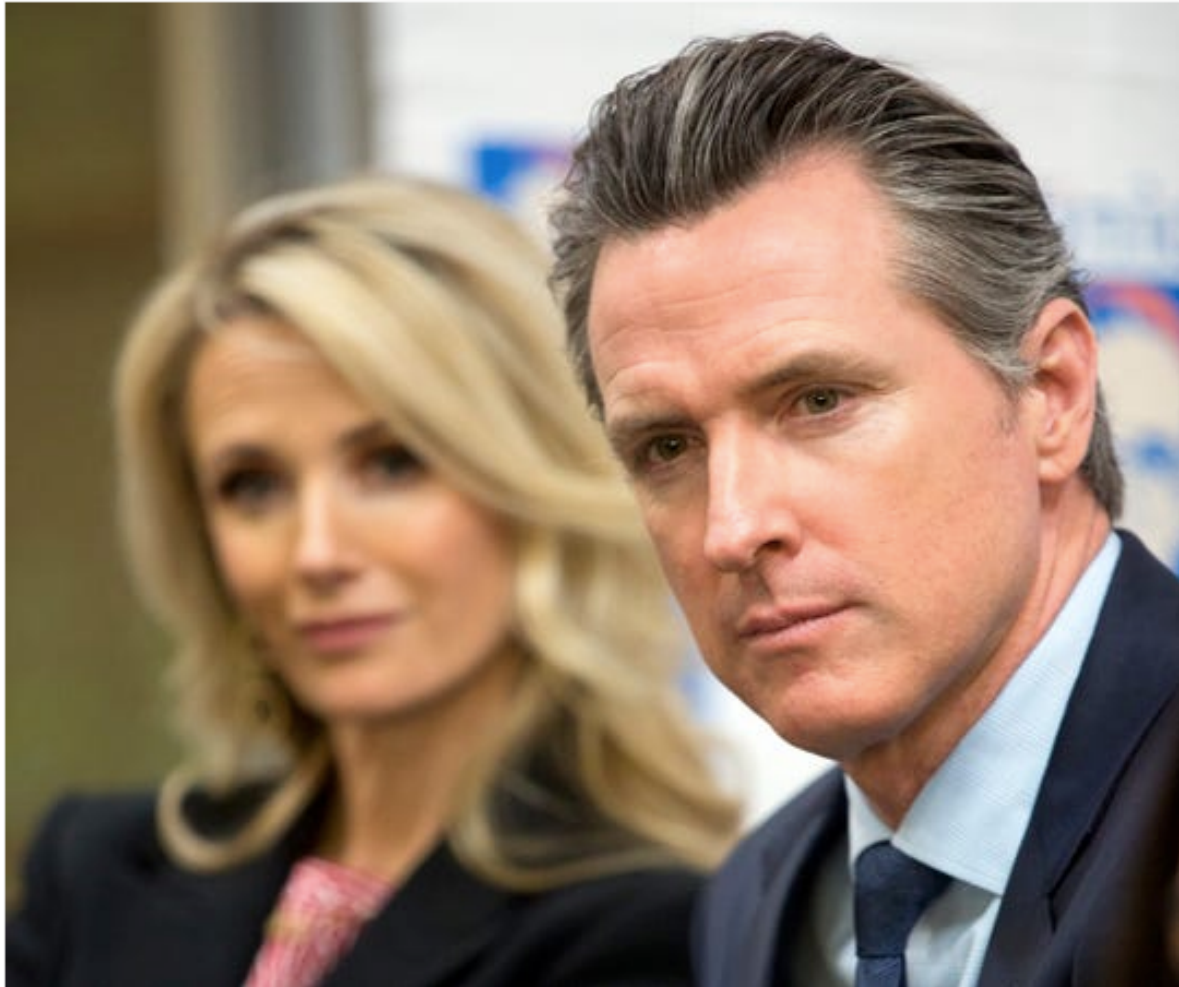
California Gov. Gavin Newsom, with his wife Jennifer Siebel Newsom, have among their holdings assets from the PlumpJack Group, a collections of wineries and hotels. When Newsom became governor earlier this year, the couple put those assets in a blind trust.

Those eyeing the bill carefully include state and local police departments, who may be on the hook for patrolling watering holes into the wee hours, as well as alcohol awareness groups who lament the increased access to drinks.